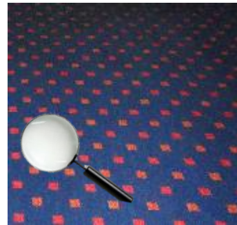
Check for stains and debris.