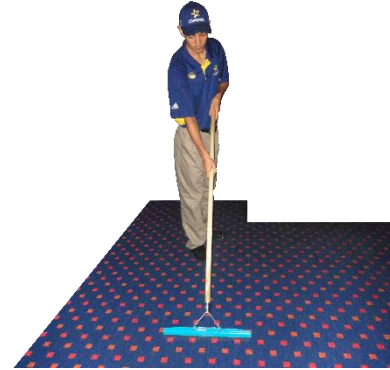
With the thick bristles brush begin to sweep the carpet to remove all dust pushing it forward.