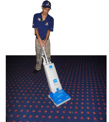
Vacuum the carpet with the upright vacuum cleaner.