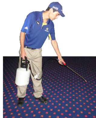
Use spray pump on stained areas.