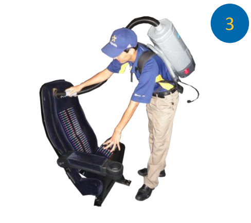
Vacuum the armchairs with the backpack vacuum cleaner.