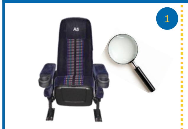
Check cleanlinessof the armchair to be cleaned.