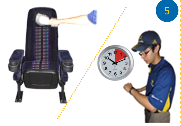
Scrub with soft bristles brush so that the product penetrates. Let it stand for 10 minutes.