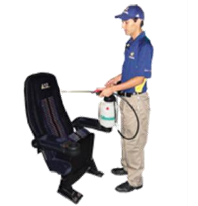
With the spray pump, spray pre-wash on the area to be cleaned to loosen dirt.