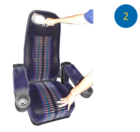
Take the soft bristles brush and brush the armchair to remove dust.