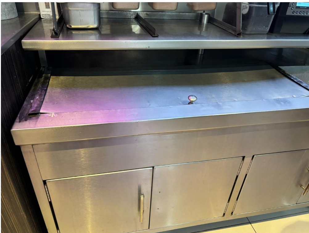
ORGANIZADOR DE JARABES